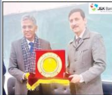
A dignitary getting memento during inaugural event of Management Development Programme by IIM Jammu.

JAMMU, Jan 16: Indian Institute of Management (IIM) here today inaugurated the Management Development