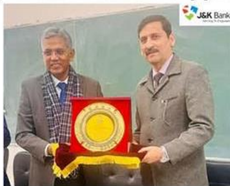
Dignitaries pose for photograph.